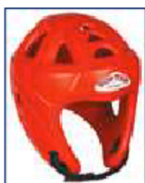
Avant-garde / Bio Flex