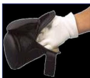
White Cotton No support