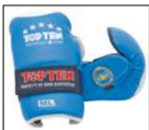
Open Hands SuperFight 3000