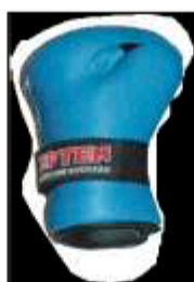
Open Hands Point Fighter